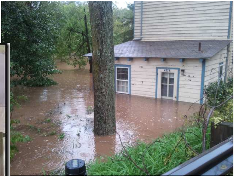
Port Mercer bridgetender's house