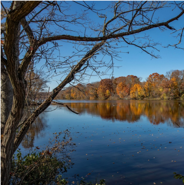
Carnegie Lake at the Millstone Aqueduct.

Participants will meet at the Millstone Aqueduct Parking Lot located at Mapleton Road in Plainsboro promptly at 10:00 am (see link above and/or below). Be prepared for a consistently paced 3-mile round-trip walk lasting about 2 1/2 hours. Bring water, dress for the weather and wear comfortable walking/hiking shoes. Inclement weather will cancel this walk. Have a question or need further information? Call the Kingston Office at 609-924-5705 or email drcanalprograms@dep.nj.gov